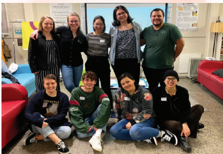
Petazae with some of our Auckland volunteers

Our volunteers are so vital to achieving our vision as an organisation and connecting in with, supporting and educating schools and communities. We are so grateful for their mātauranga, aroha and tautoko.