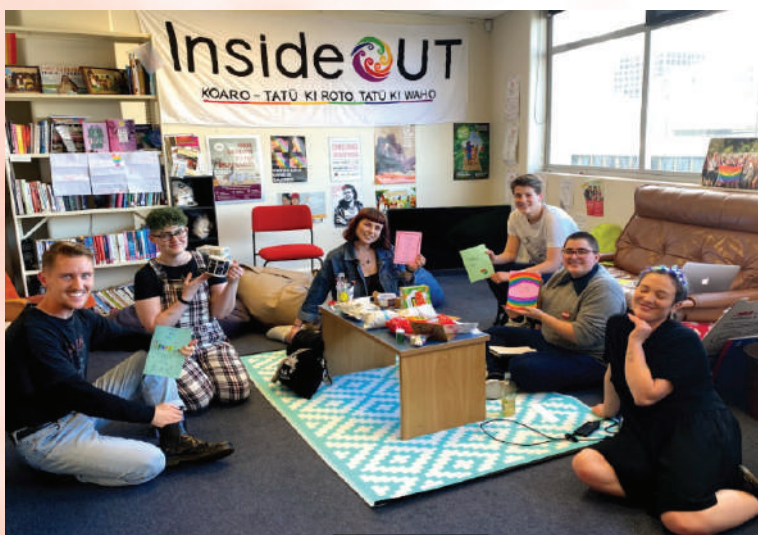
Some of our Wellington staff and volunteers