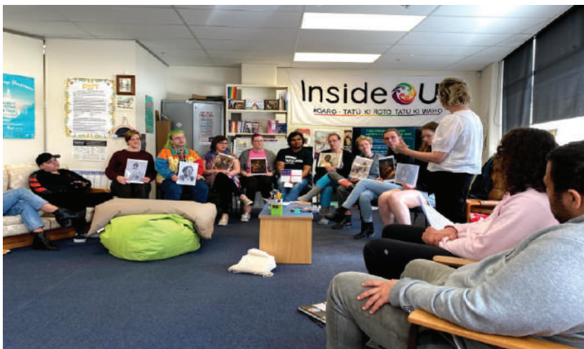
Board and staff during our Te Tiriti o Waitangi training.

Moving forward, there is a lot of work to do to further develop and refine our policies, processes, and operations to be able to strengthen our Māori tikanga and honour Te Tiriti. Work is already underway in a number of areas and hopefully across the next year, we can see the fruits of this labour and continue on this path.