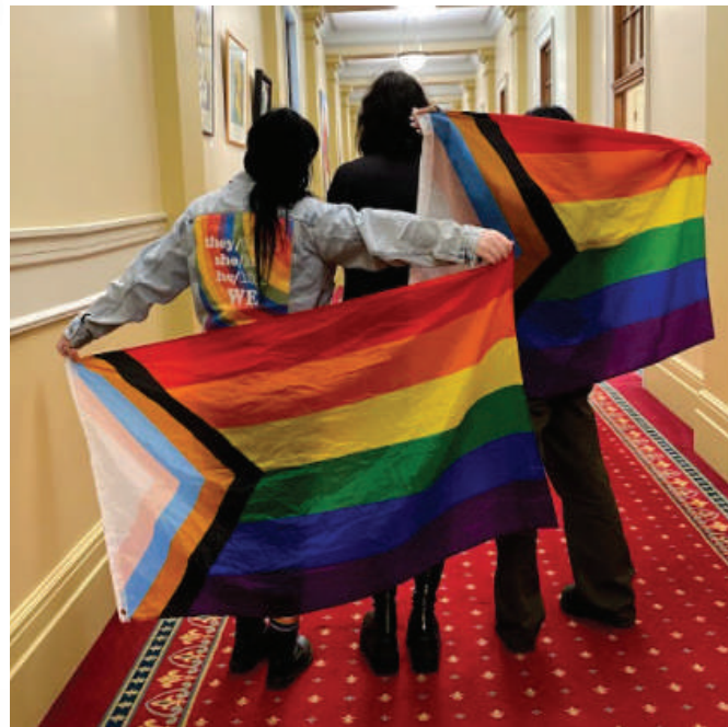
Young people's backs standing in the halls of parliament, holding pride progress flags behind them.

And the guest donors from our Givealittle page.