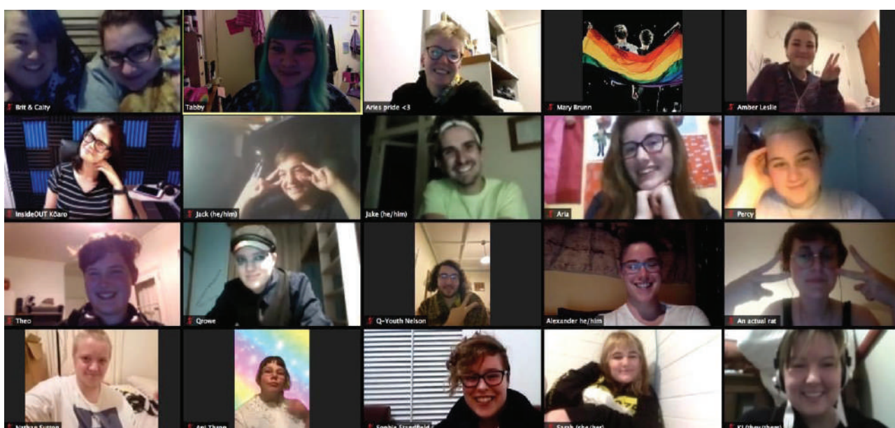
A screenshot from a zoom call during Shift Hui 2020

We also helped provide wellbeing tips and guidance on social media from our team, inspired by Te Whare Tapa Whā.