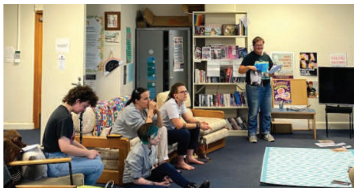
Photos from events over Wellington Pride Festival.