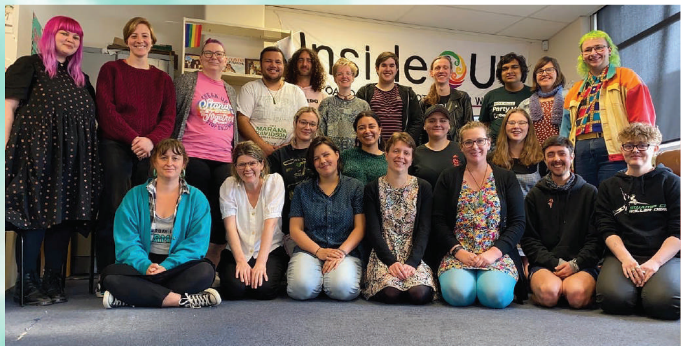
Many of our staff and board members