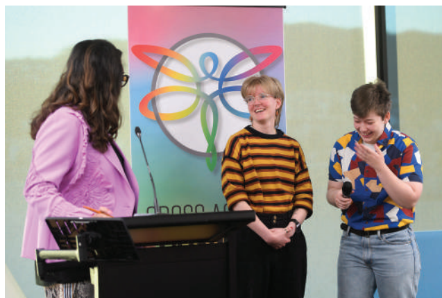
Compass and Awatea presenting to the chief executives of the public sector.

We increased the number of educational workshops delivered to workplaces, government agencies, community services and schools by over 25% compared to the previous 12 month period, delivering over 65 PD workshops this time around!