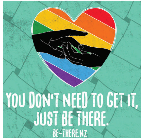
Be There poster - 'You don't need to get it, just be there. Be-There.NZ'

The Youth Sector Rainbow Collective includes Dunedin Pride, the New Zealand AIDS Foundation, Qtopia, RainbowYOUTH, Te Ngākau Kahukura, Waikato Queer Youth, InsideOUT, QYouth, Intersex Youth Aotearoa, OutlineNZ, Gender Minorities Aotearoa, and Outerspaces. The campaign has been generously supported by the Rule Foundation.