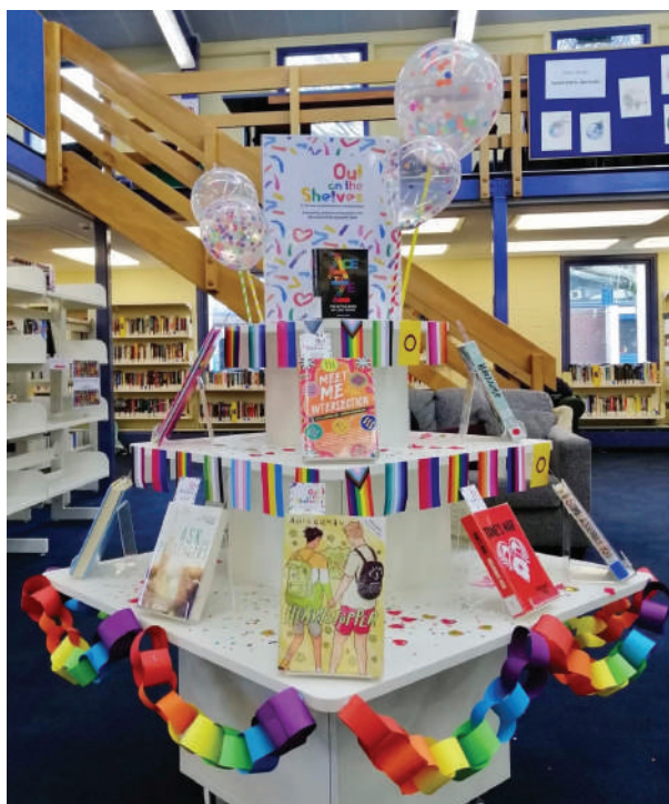
Hillcrest High's winning school entry for our display competition.

1500 bookmark sets were printed and were in high demand, with all of the first batch distributed as of October 2020. We printed a further 1130 sets to allow for distribution throughout the year. Thanks to the Rule Foundation for their support of Out on the Shelves!